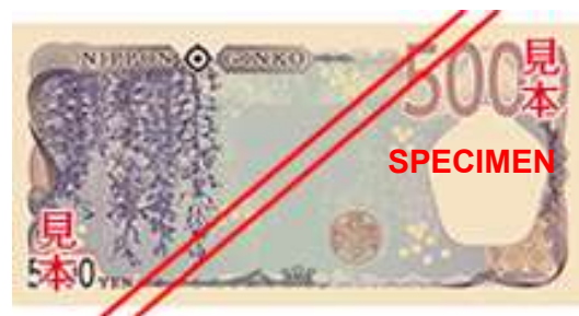
New 5,000 yen note (back)