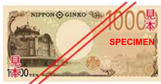
New 10,000 yen note (back)