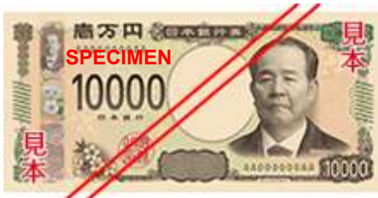
New 10,000 yen note (front)