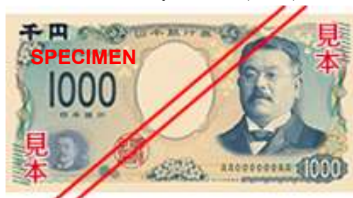
New 1,000 yen note (front)