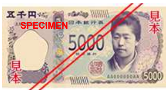
New 5,000 yen note (front)